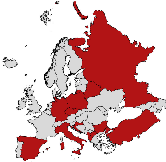
Figure 2: Representation of the countries (red shading) where reliable values of WB density are being calculated (as a pilot), by CT in 15–20 WB populations with 1–2 sites per country during 2020 and 2021 by ENETWILD ( www.enetwild.com )

WB population density values for Europe are scarce in the literature (ENETWILD Consortium et al., 2018b, 2019b, 2020a). ENETWILD is partially addressing WB population density in 15–20 locations with 1–2 sites per country (Figure 2) during 2020 and 2021.