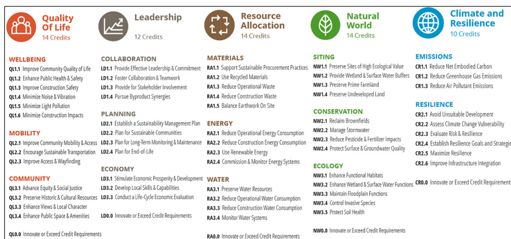
Figure 1. Categories and credits.

Each category is characterized by a basket of credits that can be satisfied by presenting adequate documentation necessary for the definition of the level of performance of the infrastructure.