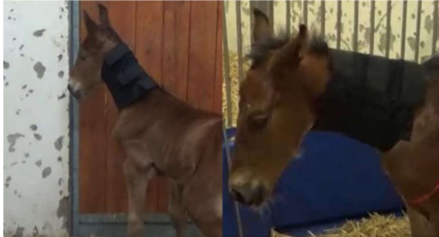
Figure 1. One of the foals used in the study wearing the collar applied to hide the possible presence of an intravenous catheter on the neck during the video recording.

black cloth collar was applied to the neck of the foals (Figure 1) before recordings. Once the collar was positioned, several minutes were waited (at least 15 minutes) until the foal seemed to be comfortable with wearing it and was not showing any discomfort behaviour (e.g., head tossing).