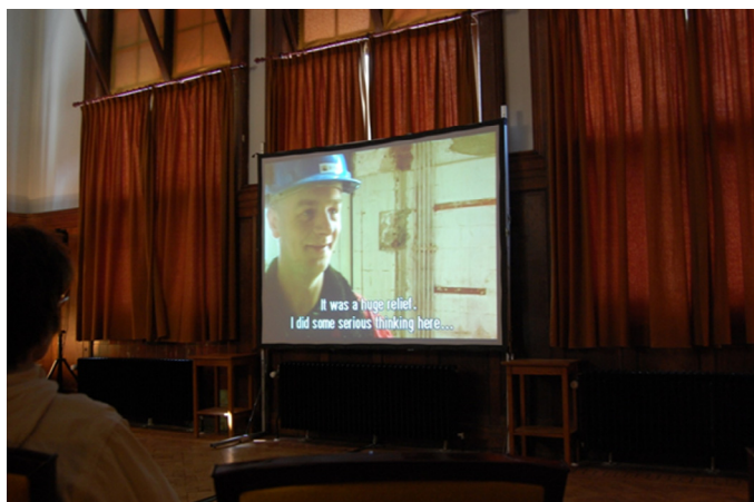
Fig. 6. 'I did some serious thinking here' – Screening of a documentary featuring the various historical phases of the hotel on an Open Day. Here, a former inmate recounts his past.

the now gentrified Eastern Docklands of Amsterdam. The Eastern Docklands is an area that, in addition to shipping productive bodies to South America, historically dealt with the shipping of goods to the Dutch East Indies. Although very rich in information, the documentary screening typically did not attract a large audience. Many left before each screening made its halfway mark and many entered mid-way too. As such, what the transient audience took in of the Hotel's violent histories was, as understood from our interviews with such visitors, in most cases, fragmented and incomplete: