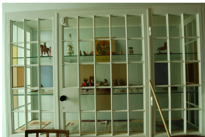
Fig. 5. Showcase created from prison doors.

Initiators and architects indeed felt that the juvenile detention centre and the Jewish refugee camp were at the origin of histories too controversial to be packaged for cultural or even 'dark' tourism, as being done at other former Dutch prisons (De Zee, 2013). On the 'Open Days', the hotel typically showcases a screening of a historical documentary in its conference room (Fig. 6). The documentary projects and narrates the history of the building through its various phases but privileges descriptions of restoration and renovation works conducted to realize its current form. Attendees of the Open Days typically include hotel guests and 'heritage tourists' visiting