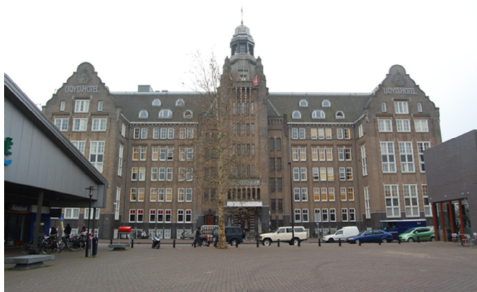
Fig. 1. Main entrance of the Lloyd Hotel and Cultural Embassy.

Inspired by the above-mentioned debates, we use the case of the Lloyd Hotel to reflect on such presumed connections between violence and space, custody and care, protection and bodily segregation, tourism and imprisonment. Despite (or perhaps because of) the multiple shifts of function from hotel to prison to hotel again, we argue that the spatial arrangements of the Lloyd Hotel may have