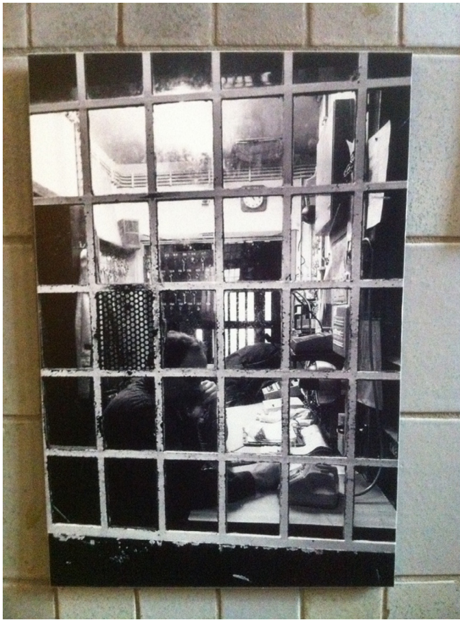
Fig. 3. A photo of a prison cell in Lloyd Hotel.

that the toilets could only be accessed from the outside and could not be monitored by the guards positioned in the halls. According to the then director, these spatial arrangements led to much 'conspiracies and violations' ranging from bullying to breaking the law: