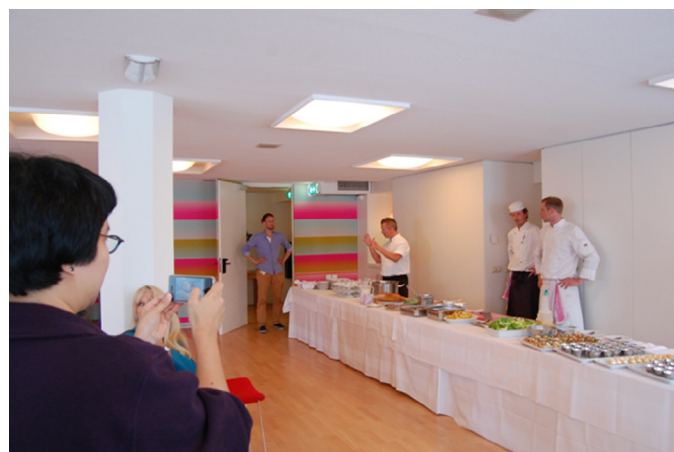
Fig. 2. The hotel and 'cultural embassy' as gastronomic and leisure space.