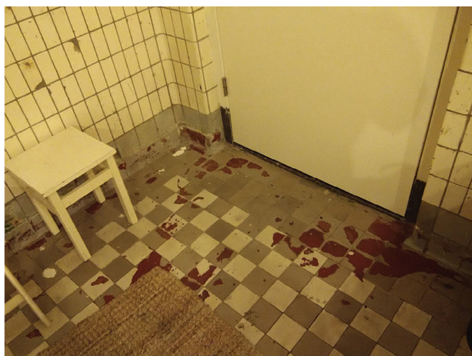
Fig. 8. Stains on original old green tiles: a 'dark' presence for some guests.

relational concept of violence and space/place? Is tourism a fundamentally disciplining field, and if so, what are tourist enclaves telling us about the self-disciplining qualities of certain spatial arrangements? Is perhaps self-disciplining what connects spaces of imprisonment to those of leisure?