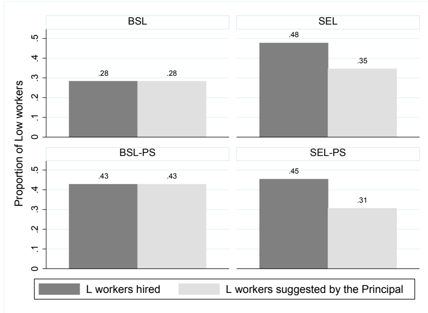
Figure 1: Proportion of L workers suggested by the principals and hired by the agents across treatments

proportion of L workers hired increases across periods starting from an average of 41.12% in periods 1 – 5; increasing to 47.48% in periods 6 – 10 and reaching 49.91% in the last five periods. 16