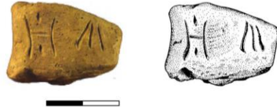
Figure 5. Cypro-Minoan label found at Ugarit (RS 94.2328), ##210. Photograph adapted from Ferrara 2012.