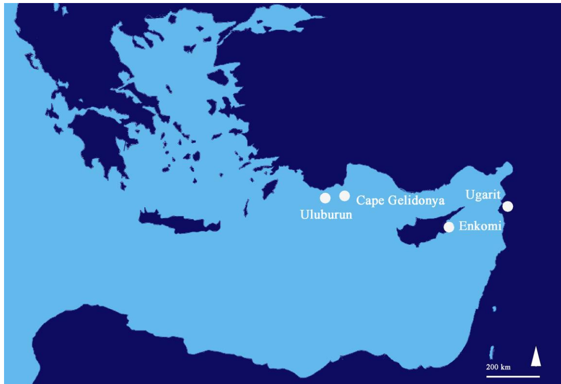
Figure 1. The Eastern Mediterranean, showing locations mentioned in the text.