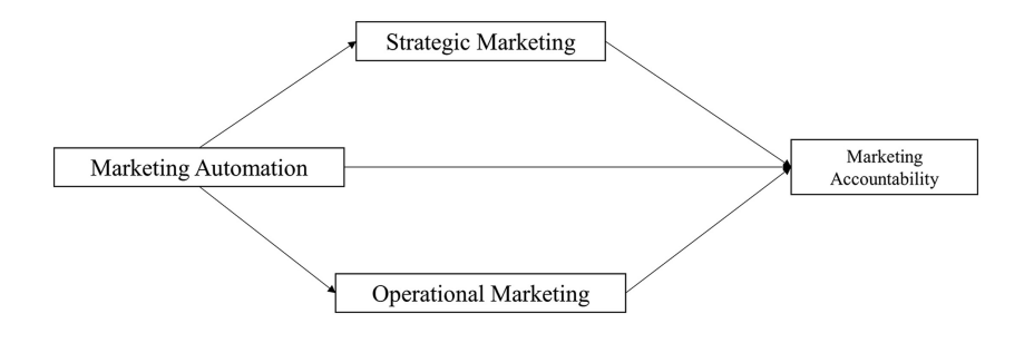
Figure 1. The identified components of marketing accountability