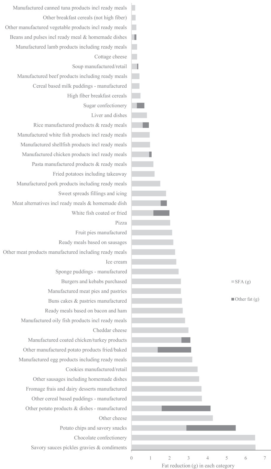
FIGURE 3 Mean reduction in SFA (g) and other fat (g) for 100 g of the product category included in the strategy.

health benefits if the fat reduced were to be replaced with high-fiber ingredients, as the average fiber intake would be increased to be closer to the population target of 30 g/day, as recommended by SACN (12, 16).