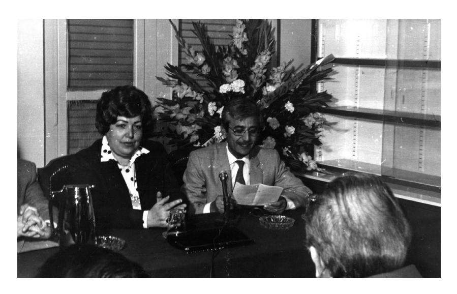
With Dr Najah el-Attar, when she was Minister of Culture of the Syrian Arab Republic