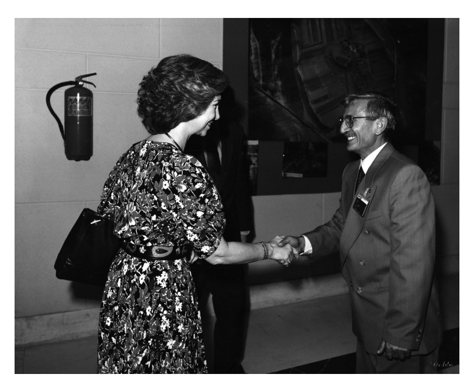
With Queen Sofia of Spain at the Expo of Seville in 1992