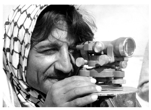
On the excavation