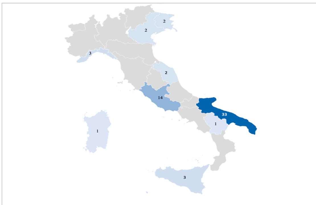
Fig. 1. Distribution of the Companies investigated.