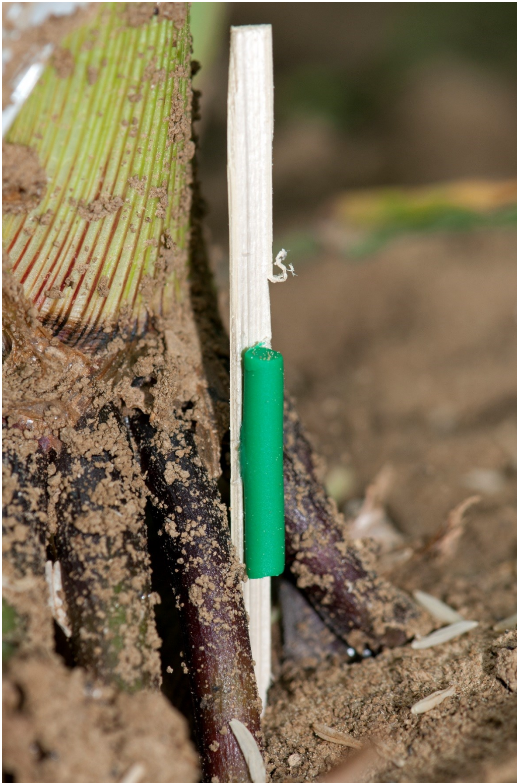
Fig.1 An artificial caterpillar exposed at the base of a maize plant, as if it were about to climb the maize stem.