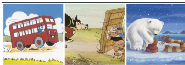
Figure 2: The proposed tasks. From the left: “Bus Story Test”, “Three Little Pigs” and “Little Polar Bear”.

The corpus is composed by caregiver-child spontaneous speech interactions (duration: min. 3’51” - max. 23’53”), for a total of 1h57’41” transcribed audio-visual material. Oral production was elicited through three different tasks: the norm-referenced Bus Story Test (I-BST) (Renfrew, C.E., 2015; Cipriani et al., 2012; Mozzanica et al., 2016), and two semi-spontaneous retelling assessments, exploiting the renowned story Three Little Pigs (3LP), and a brand new short film called Little Polar Bear (LPB). While the I-BST examines story retelling with a colored picture support, the unnormed tests elicit children’s verbalizations through a paper book and a tablet respectively. During the 3LP task, children were asked to retell the renowned story using the pictures as prompts while flipping through the pages; in contrast, the LPB task was administered showing the video (around 100 seconds) to the child who was then requested to recount the plot while following the scrolling images without sound. None of the children knew the three stories. The trials were administered in a single test session of varying duration (~30 minutes).