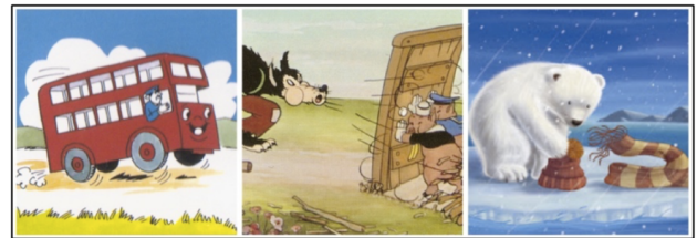
Figure 2: The proposed tasks. From the left: “Bus Story Test”, “Three Little Pigs” and “Little Polar Bear”.

The corpus is composed by caregiver-child spontaneous speech interactions (duration: min. 3’51” - max. 23’53”), for a total of 1h57’41” transcribed audio-visual material. Oral production was elicited through three different tasks: the norm-referenced Bus Story Test (I-BST) (Renfrew, C.E., 2015; Cipriani et al., 2012; Mozzanica et al., 2016), and two semi-spontaneous retelling assessments, exploiting the renowned story Three Little Pigs (3LP), and a brand new short film called Little Polar Bear (LPB). While the I-BST examines story retelling with a colored picture support, the unnormed tests elicit children’s verbalizations through a paper book and a tablet respectively. During the 3LP task, children were asked to retell the renowned story using the pictures as prompts while flipping through the pages; in contrast, the LPB task was administered showing the video (around 100 seconds) to the child who was then requested to recount the plot while following the scrolling images without sound. None of the children knew the three stories. The trials were administered in a single test session of varying duration (~30 minutes).