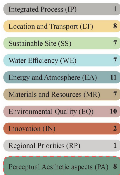
Figure 1. Proposed variation to LEED category and corresponding number of credits.

A testing phase is envisaged for these eight new credits: according to the U.S. GBC LEED rules they could be included within the Pilot Credit Library, from which additional credits can be freely selected by the design team and inserted in the Innovation category (IN) of whichever LEED scheme [52]. However, this GBC procedure allows for a maximum of 5 points to be earned by pilot credits [53]. Therefore, the research proposes moving a step further and enhancing the LEED scheme with a brand-new category - 'Perceptual-aesthetic aspects (PA)' - collecting the eight additional credits and adding on the LEED existing ones (Figure 1).