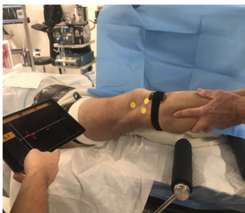
Figure 2. Measurement of lateral compartment translation and acceleration during a quantitative pivot-shift test. The examiner performed a standardized pivot-shift test, while an assistant held the tablet computer in a fixed position to track the skin markers.