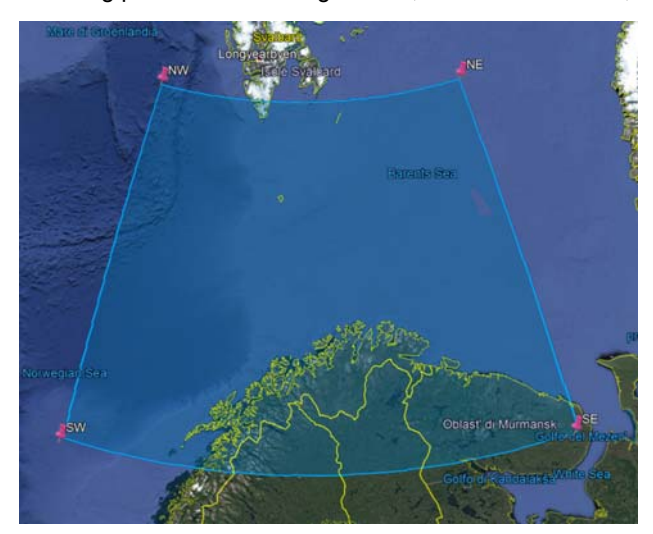
Figure 1: Case study: map view of the area

The code implementing the RGA procedure was applied to a sea area off the Northern coast of Norway, including parts of the Norwegian Sea, of the Barents Sea, and of the Greenland Sea, as shown in Figure 1.