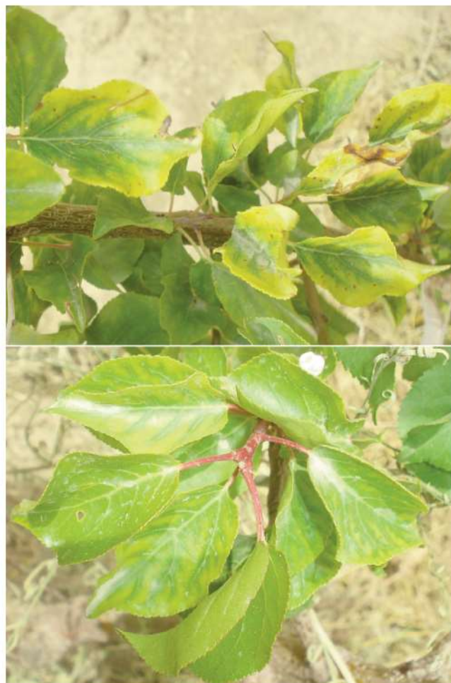
Fig. 2 - Yellowing observed in an apricot accession during sample collection in a National Collection Centre.

All apple and pear plants analysed (180 samples) resulted free from ACLSV, ApMV, ASGV and ASPV. Symptoms such as yellowing, leaf distortion and puckering were observed in some stone fruit plants during collection of the 5521 samples that were tested by DAS-ELISA (Fig. 2). Among them, 23 (0.4%) samples collected from several MSNs in Kabul, Khandahar, Parwan, Herat and Baghlan provinces resulted positive to ACLSV. In particular, there were two plants of European plum (Clone 364/local name Alu BokharaShalili), one cross of Myrobalan and Japanese plum (4031/Grangej Zard), 17 plants of peach (five from 804/Turki Sorkh, five from 812/Dir Ras and seven from 811/TurkiZard), one plant of almond (159/Sattarbai Bakhmali) and two plants of apricot (373/Shakarpara and 4037/Aqa Banu). Two (0.03%) almond samples, both collected from the NCC in Balkh province, resulted infected by ApMV; in was interesting that one of them also tested positive to PNRSV. Analyses against PNRSV evidenced 38 samples (0.6%), collected from NCCs or MSNs located in Balkh, Herat, Kabul, Khandaharand Paktya as infected by the virus (13 almond, five plum, nine peach, and 11 cherry plants). Finally, one plum sample (cv. Alu Bokhara Shalili), from a MSN in Kabul, resulted infected by PDV while none of the stone fruit samples tested resulted positive to PPV (Tables 2-6 and Fig. 3).