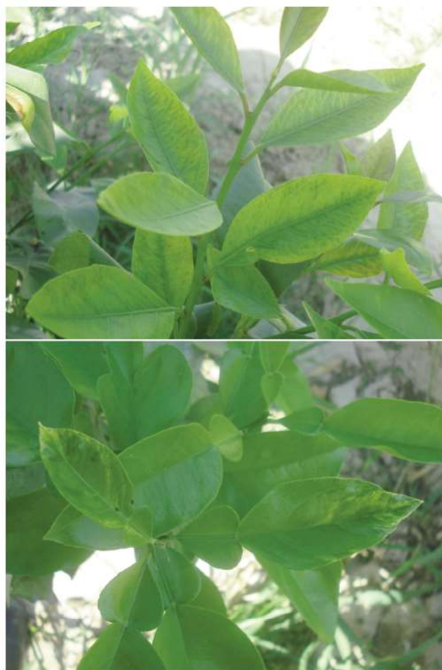
Fig. 4 - Vein clearing and yellowing symptoms observed in citrus accessions collected from the National Collection Centre in Jalalabad (Nangarhar province).

In particular, regarding ACLSV isolates, a 677-long nucleotide fragment, corresponding to partial coat protein gene, was amplified from all ELISA-positive samples by RT-PCR using ACLSV sense and antisense primers (Menzel et al., 2002). Eleven of the identified isolates of ACLSV were then characterized molecularly. Sequence analysis revealed similarity ranging from 83.6 to 100.0% within ACLSV isolates detected in Afghanistan. Blast analysis showed that sequences of two peach isolates, 812/Dir Ras, shared the highest nucleotide similarity (95.8 and 96.2%) with the GenBank ACLSV isolates Apr 3 from Jordan (AJ586631). Moreover, the same Afghan isolates showed nucleotide identity between 95.0 and 95.7% with isolates S4, PP23, PP63, and HL2 (JN849008, GU327991, GU328003 and GQ334211, respectively) from China. Sequence analysis of isolate 364/Alu