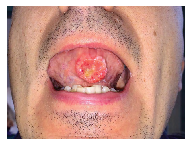
Fig. 1. Ulcerated lesion of the tip of the tongue upon the patient's referral.

Prelaminated oral mucosa has been implemented in oral cavity and facial defect reconstruction. <sup>13–17</sup> Due to a high cell renewal rate, morselized buccal mucosa grafts can spread over a vascularized fascial bed and become functional in 3 weeks. <sup>13</sup> Alternative surgical options for TOT reconstruction could be FAMM (facial artery muscolomucosal) flap, Zhao flap, RFFF, or primary suture. <sup>4,18–20</sup> In the authors' opinion, a fasciomucosal prelaminated