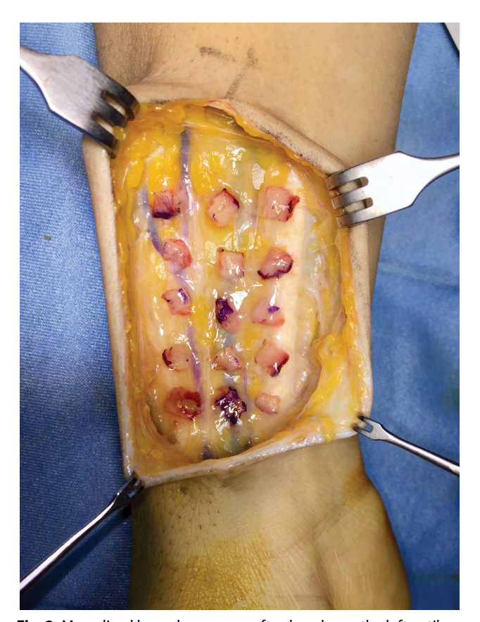
Fig. 2. Morselized buccal mucosa grafts placed over the left antibrachialis fascia.

RFFF offers a series of advantages for TOT reconstruction. It is a thin and pliable flap that preserves the physiology and lubrification of the oral mucosa. The absence of subcutaneous tissue makes the PFRFFF much thinner than fascio-cutaneous flaps. <sup>14</sup> Compared with mucosal loco-regional flaps, prelaminated flaps allow the preservation of oral mucosa lining while providing adequate bulk and reduced scar formation for optimal functional