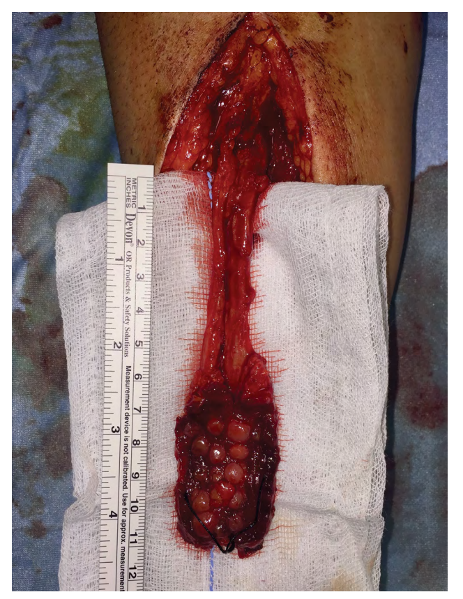
Fig. 3. Morselized buccal mucosa grafts after 3 weeks.

recovery.<sup>13</sup> Because only a thin oral mucosal sheet is harvested, while keeping a 1-cm safety distance from Stensen duct, donor site morbidity is minimal and no further intervention is needed. Prelamination resolves the necessity for skin grafting in the forearm, one of RFFF's major disadvantages.<sup>12</sup>