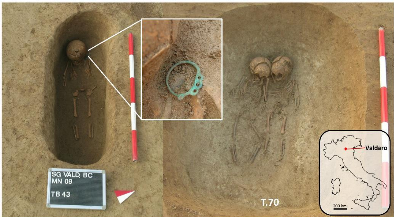
Figure 1. Photographic record of tombs 43 and 70, showing the earring found in tomb 43. The location of the Valdaro site is also reported in the inset.

V = 0 no association; V = 1 complete association.