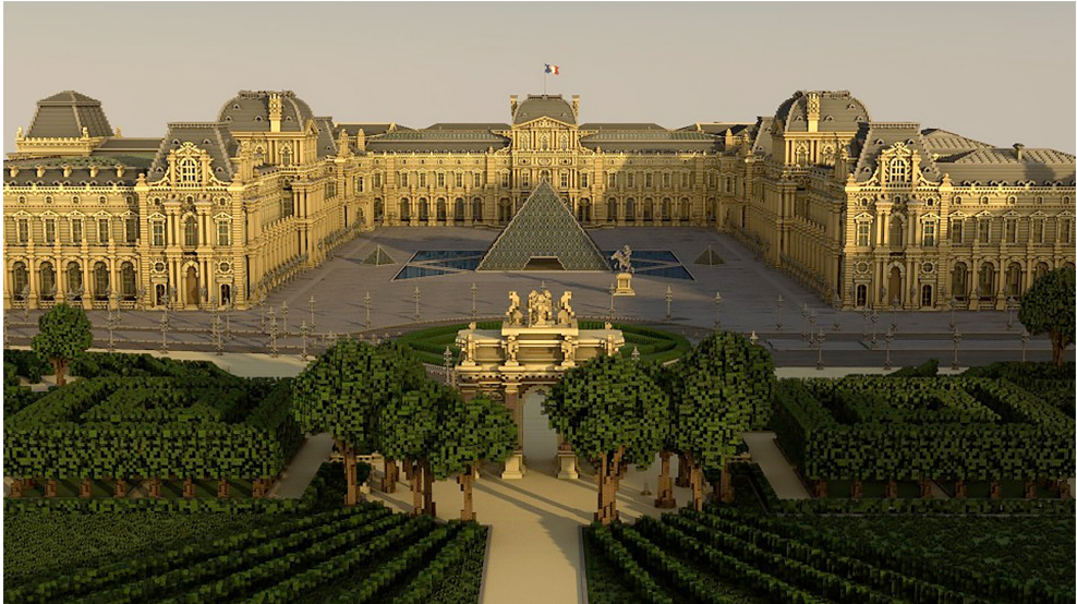
Fig. 5 Persson, M. (2009). Minecraft , videogame. Stoccolma, SE: Mojang.