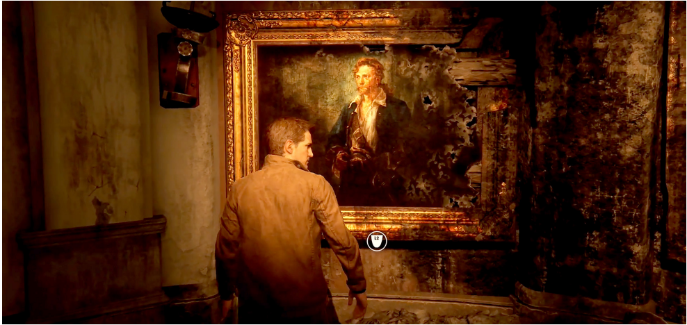
Fig. 1 Uncharted 4 : Druckmann, N. (2016). Uncharted 4: A Thief's End , videogame, Tokyo, JP: Sony Computer Entertainment.

pwood, the main character of The Secret of Monkey Island and all the other games of that saga.