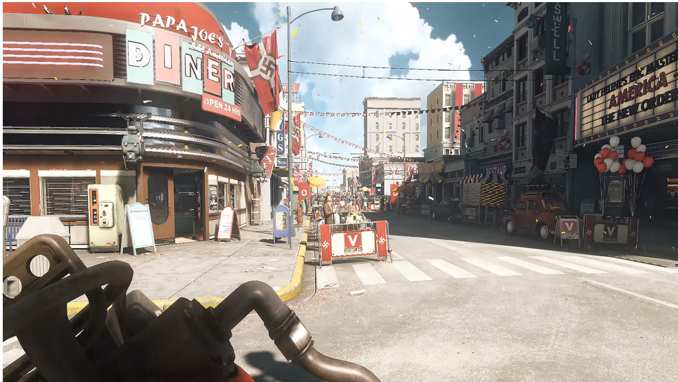
Fig. 2 Öjerfors, A., Berg, A., & Afzoud, A. (2017). Wolfenstein II: The New Colossus , videogame, Bethesda, MD: Bethesda Softworks.