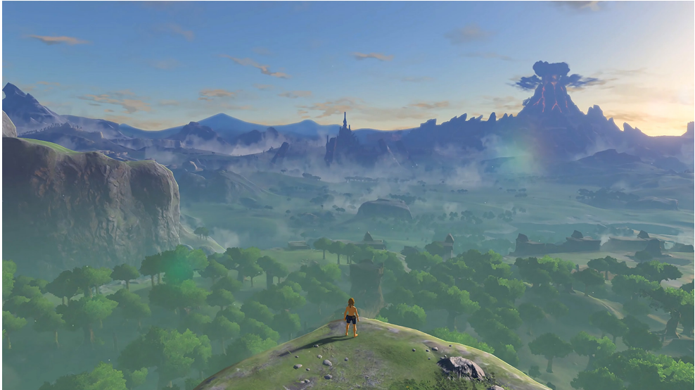
Fig. 4 Aonuma, E. (2017). The Legend of Zelda: Breath of the Wild , videogame, Kyoto, JP: Nintendo.