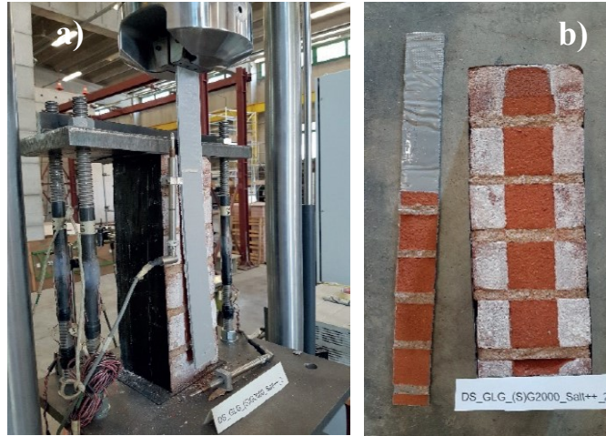
Figure 2. (a) Direct shear test set-up and (b) debonding with cohesive fracture of the support of SRP specimens.