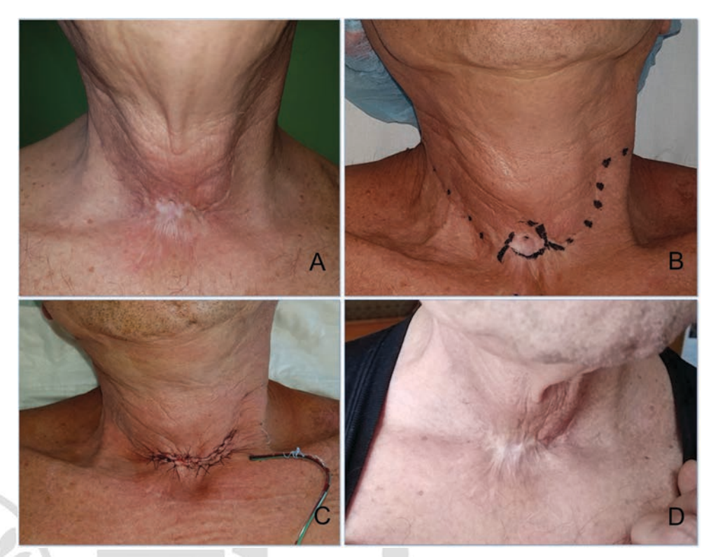
Fig. 2 (A) recurrent tracheocutaneous fistula after subtotal laryngectomy, radiotherapy and right neck dissection, and multiple closure attempts. (B) Preoperative markings: planned scarred skin excision around the fistula. Marked dots over previous neck surgical scars. (C) Immediate postoperative result. (D) Result at 20 months follow-up: excellent functional result without complications and a satisfied patient

the skin, also provides easy access to the trachea and the sternal and clavicular insertions of sternocleidomastoid muscles.