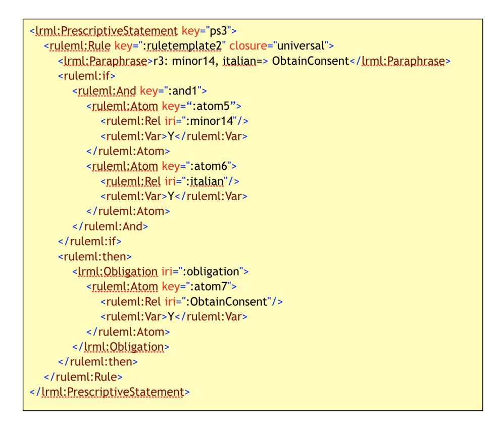
Figure 2.: LegalRuleML of the Art. 8 GDPR.

[1, 15] using defeasible logic (as shown in figure 2), in order to be able to represent the fact that the GDPR art. 8 rule (16 yearsOld) is overridden with the Italian's one (14 yearsOld). The SPINDle legal reasoner processes the correct rule according to the jurisdiction