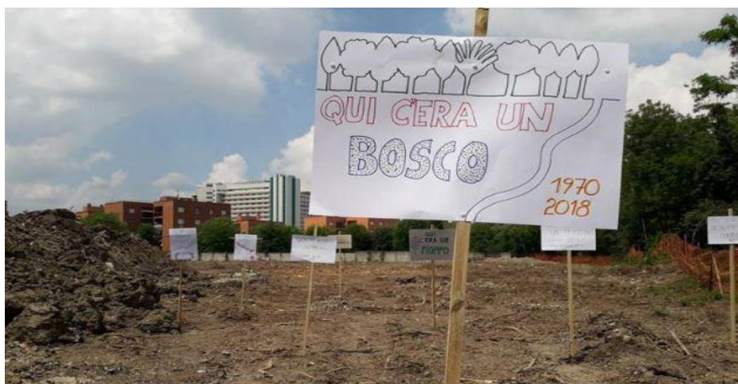
Figure 5: A demonstration organized by Rigenerazione No Speculazione in the deforested area. The sign states “Here there was a forest, 1970-2018”.

No Speculazione and the network argued the political nature of the Prati di Caprara regeneration project highlighting privatization processes, real estate speculative nature and non transparent relations between the ruling party and private actors; moreover, they strengthened their narrative by claiming the right to an alternative vision of urban futures characterized by social and climate justice. In few months, the network of associations, together with heterogeneous critical support from the civil society, shifted into a socio-environmental movement oriented towards the struggle for grassroots democracy and environmentalism as well as towards the radical reconfiguration of POC.