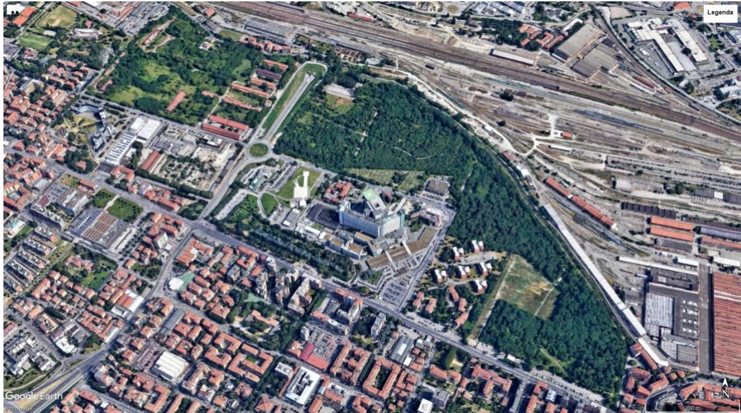
Figure 7: The Prati di Caprara forest in late summer 2019. On the right, in Prati di Caprara eastern part, the 2 hectares of forest removed in spring 2018 to enable the construction of the school. In this area, over the last two years a renaturalization process is enabling the growth of new vegetation since the school construction project is currently stopped.