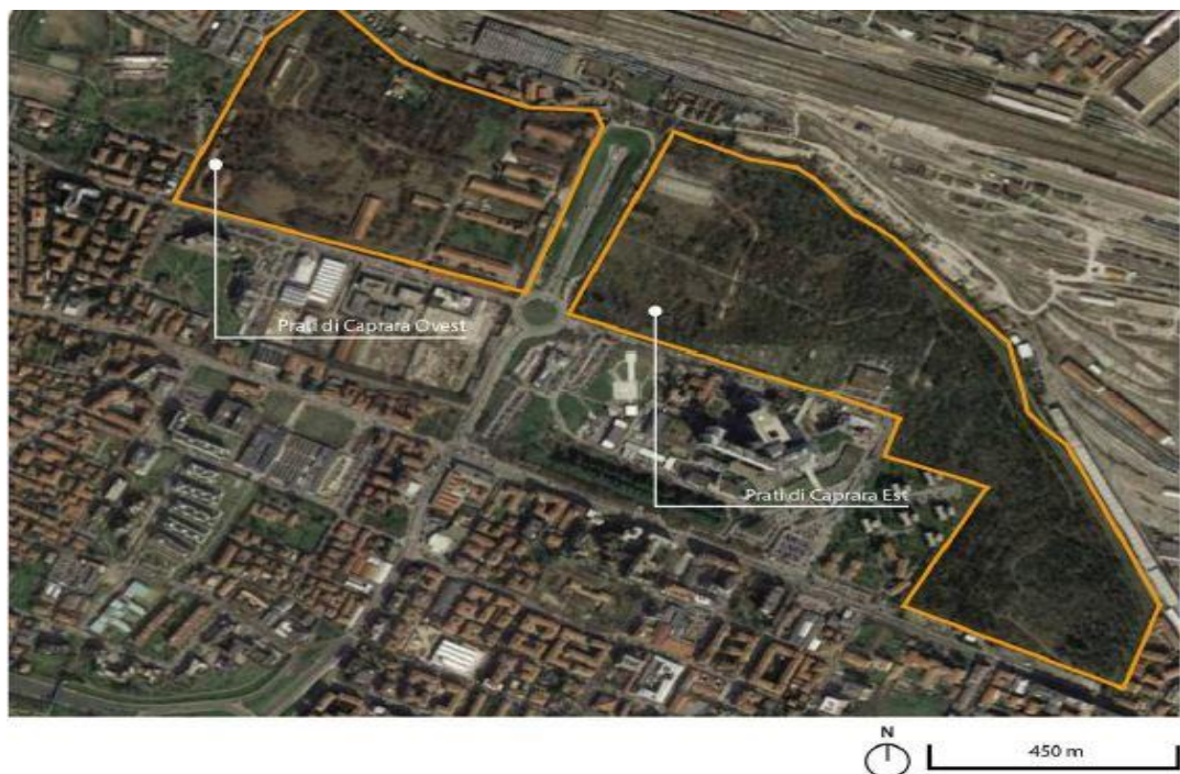
Figure 2: GIS elaboration of a Google Earth TM satellite image that represents Prati di Caprara urban forest area and its eastern and western parts.

that started to claim the need to preserve the Prati di Caprara forest. Moreover, participatory excursions and observations in the forest were organized in order to raise awareness on the socio-environmental value of the area. This approach, embedded in Bologna's urban activism, was strategic to explore, understand and analyze social implications at the neighbourhood scale in-depth. Semi-structured interviews, formal and informal conversations and exchanges were conducted with members and representatives of urban groups and associations as well as with members of the neighbourhood community. These were conducted also with experts and academics such as urban planners, natural and social scientists as well as former local politicians and consultants. Furthermore, data and information on urban regeneration policies, and related institutional procedures, strategies and visions, were collected through semi-structured interviews and formal meetings with members of the City council and political parties. Ethnographic research was integrated with the analysis of institutional policy documents, local newspapers, media and discourses with the aim to critically analyze the political nature of urban regeneration policies.