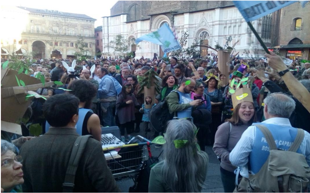
Figure 6: A demonstration of the socio-environmental movement in Piazza Maggiore in front of the building of the City Council, March 2019.