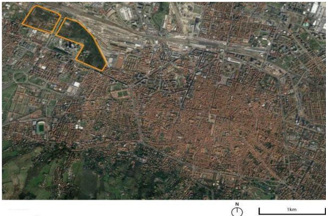
Figure 1: GIS elaboration of a Google Earth TM satellite image that represents the Prati di Caprara urban forest area in the north-western part of Bologna (source: authors).

The urban forest of Prati di Caprara in Bologna and the political and environmental debate around its regeneration processes represent a key case-study. On the one hand to highlight the political nature of renaturalized areas and urban forests as socio-natures, product of metabolic socio-environmental relations characterized by transcalar conflicting interests and dynamics. On the other to explore how contested urban regeneration policies enable urban community empowerment and the rise of a socio-environmental movement. With regard to the methodology, data were collected through policy documents analysis and an ethnographic approach; ethnography represents a key method to critically analyze socio-environmental conflicts and more in general social transformation processes in relation to urban policies.