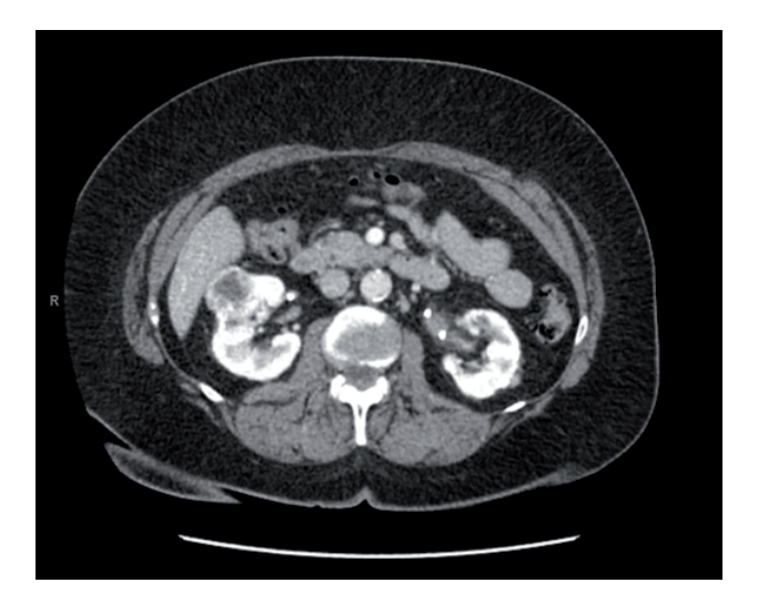
Figure 4 - Preoperative TC SCAN image.

In 30 cases the artery was clamped; in all patients the hilum was identified and the artery isolated and double-surrounded by a vessel-loop, left in place tension free. None of the patients