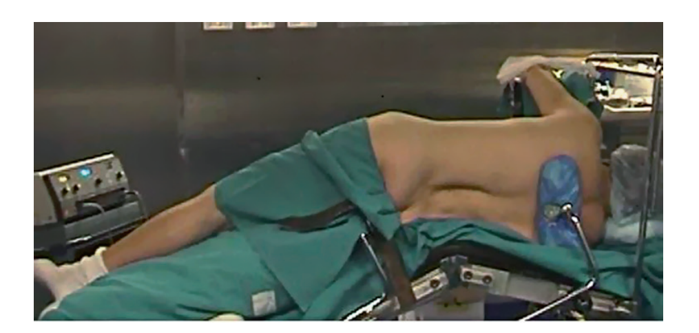
Figure 1 - Patient positioned.

Between September 2010 and December 2015, we performed 81 Retroperitoneoscopic RAPN (44 left and 37 right) (Table-1). Average size was 3cm (1-9cm). The nephrometry score of the tumors was calculated using R.E.N.A.L and PA-DUA scores (4). The exclusion criteria in the selection of patients for this type of surgery were: anterior masses of the lower pole, anterior masses of the hilum, previous retroperitoneal surgery, spinal abnormalities. Surgical technique: the patient is positioned on full flank position, the umbilicus on the break point of the of the table, the legs are positioned and a pillow is put in between (the internal leg is flexed at 45°, while the external leg is totally extended). The table broken until maximum skin extension reached in order to have as much working space as possible. The arm is positioned on an armrest secured close to the head as much as possible. The patient is secured by two supports placed behind: one on the upper part of the back at level of interscapular line and one on the lower part of the back at the level of sacrum bone. The patient is then further secured to the Table with Tensoplast® at shoulders level and at knee level (Figure-1). An oblique 1.5cm incision