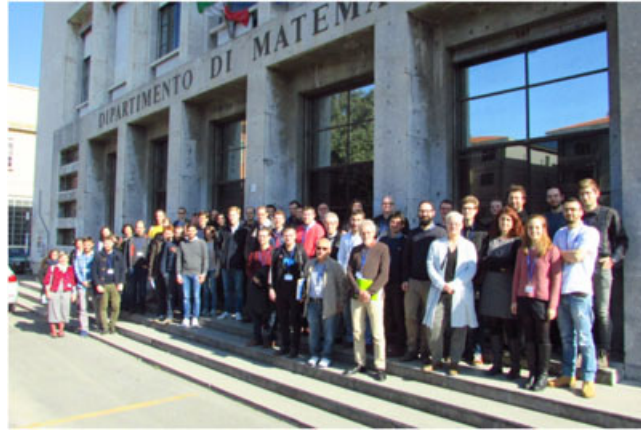
FIGURE 1 Participants of the 7th Matrix Equations and Tensor Techniques (METT) Workshop in Pisa

derived. For the general case, the problem at hand is reformulated as an optimization problem and a trust-region method is applied. Several numerical experiments, including applications in face recognition and blind deconvolution, demonstrate the effectiveness of the proposed approach.