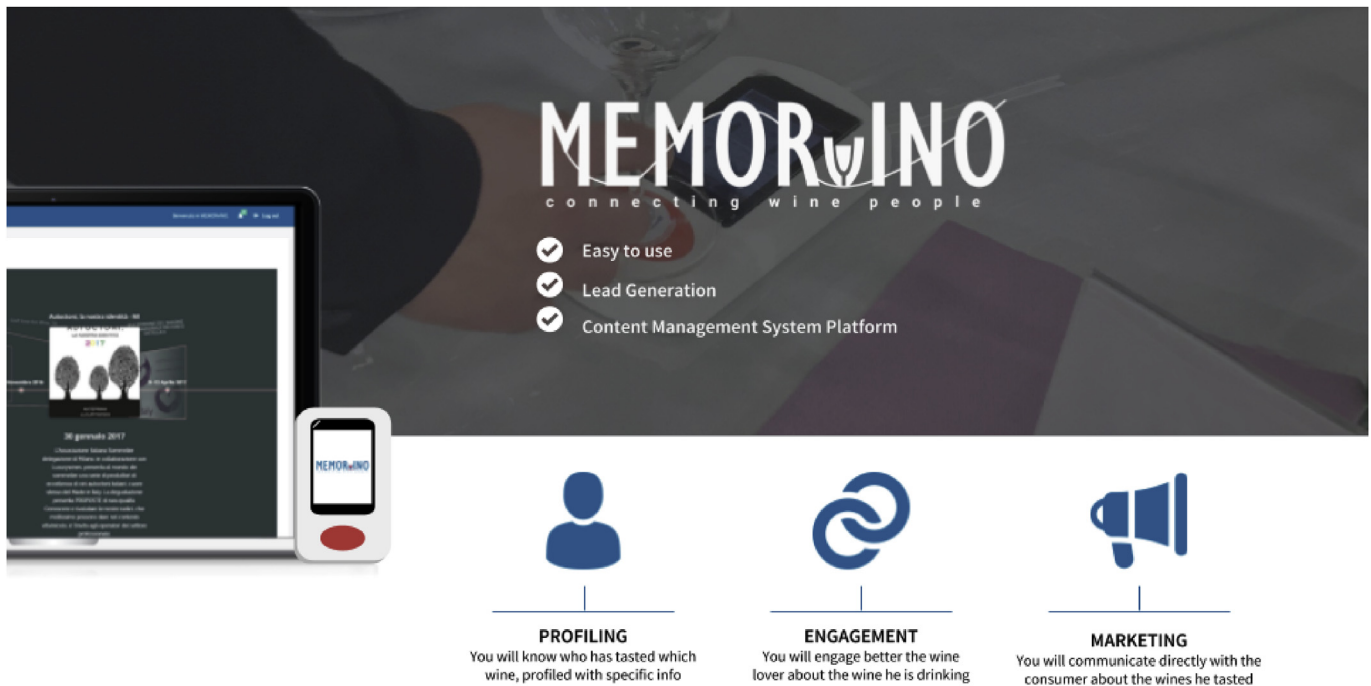
Fig. 2. MEMORvINO's benefit overview (Source: Wenda internal files).

event's actors with useful information thanks to an overall involvement.