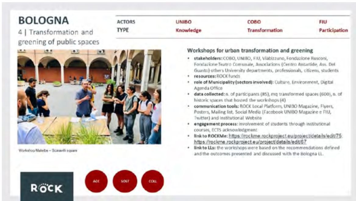
Fig. 4 U- The Malerbe workshop for urban transformation and greening.

The choice to refer to urban micro-design seems particularly effective because it is economically sustainable in a period of scarcity of public resources that traditionally finance interventions on the public spaces of the city. As in the Malerbe case, micro-design solutions often refer to bottom-up initiatives, through collective support for the initiative or in other cases are the result of mixed approaches involving unconventional associative forms and financial schemes for implementation (Gianfrate, Longo, 2017).