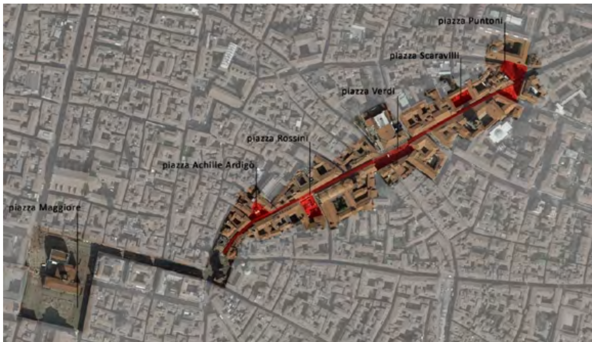
Fig. 2 The “Zona U” demonstration area in Bologna (in red).

The growth of the student population (about 80,000 students), the change in the number and composition of population in the centre, due to migration phenomena (15.000 new residents each year, of which 9.000 Italian) and the effects of the growing new tourism dynamics, have not been integrated and absorbed in the area, whose public spaces capacity is limited. These dynamics has generated phenomena of social conflict between different categories of users and triggered decay and disturb. In particular, the presence of the students, vital and positive per se, is turned into a problematic issue for the coexistence with the other actors of the area. The Zona U stands out as the main place where population (expecially students) of excluded people from urban dynamics gather and meet every day.