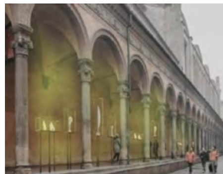
Fig. 8 e 9 Lighting project for Piazza Rossini and the Via Zamboni porticos, with display cases for temporary exhibitions.