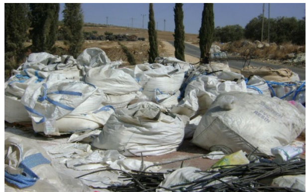
Fig. 4 Plastic storage for recycling

Compost is unable to compete favourably with inorganic fertilisers because the latter shows results very quickly (Harper 2004; Rouse et al. 2008). This affects the uptake of compost by farmers and other potential users particularly in low-income areas such as Al Jalameh. But given adequate time, compost has been reported to sustainably improve soil fertility (Diacono and Montemurro 2011; Golabi et al. 2004; Ouédraogo et al. 2001). Farmers in developing countries often cannot afford to wait for long-term results. As shown in Table 3, farmers in this region use large quantities of inorganic fertilisers. Restoring the soil structure due to years of dependence on inorganic fertilisers require relatively large quantities of and high investments in compost which serve as disincentive for local farmers. More often, farmers are not well informed on compost application and performance. This knowledge gap creates unrealistic expectations which leads to disappointment (Rouse et al. 2008) and, consequently, to a switch from compost back to inorganic fertilisers. For this reason, an effort has been made to enhance the awareness of farmers of Al Jalameh and to educate them on the effectiveness of compost as soil conditioner, which may lead to reduction in the need for chemical fertilisers. In addition, the marketing approach of encouraging members of the cooperative to use the compost would lead to a real breakthrough.