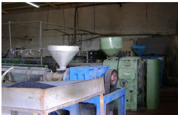
Fig. 5 Plastic selection laboratory

pipes are used to produce plastic pipes to be used as conduit for electrical cabling.