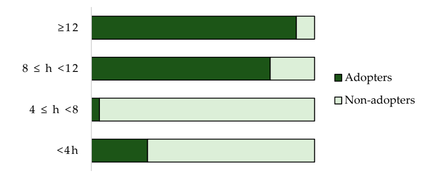
Figure 3. Percentage of PFT adopters and non-adopters per number of hours spent on information or formation activities.

Figure 3 shows that adopters are well-informed, and they spend more than eight hours/month on information and formation activities; non-adopters dedicate less than that. "Precision Farming is an information intensive activity" [106]. A farmer might opt for quick adoption if he is more likely to receive new information providing PFT. It is not easy to quantify the information intensity degree of farmers. It can be measured by considering access to information from a source (mass media or interpersonal communication such as consultants or extension services), or how often an individual receives the information within a period [83].