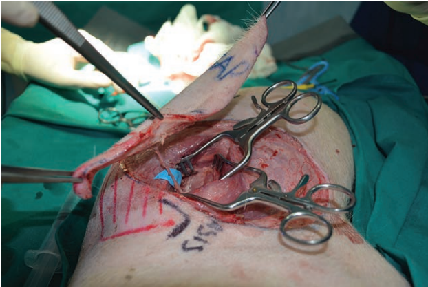
Fig. 2. Intraoperative view at the end of flap dissection. The observer is placed at the pig's head; the flap is lifted. The 2 Weitlaner retractors hold the split muscle fibers spread apart. The isolated perforator pedicle is placed on top of a blue background. Compared with humans, the flap is a lot thinner in pigs.