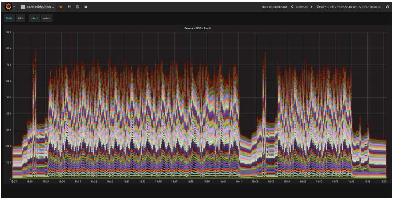
(a) Stacked power plot. One line for each node power consumption. Absolute value: cluster power consumption.