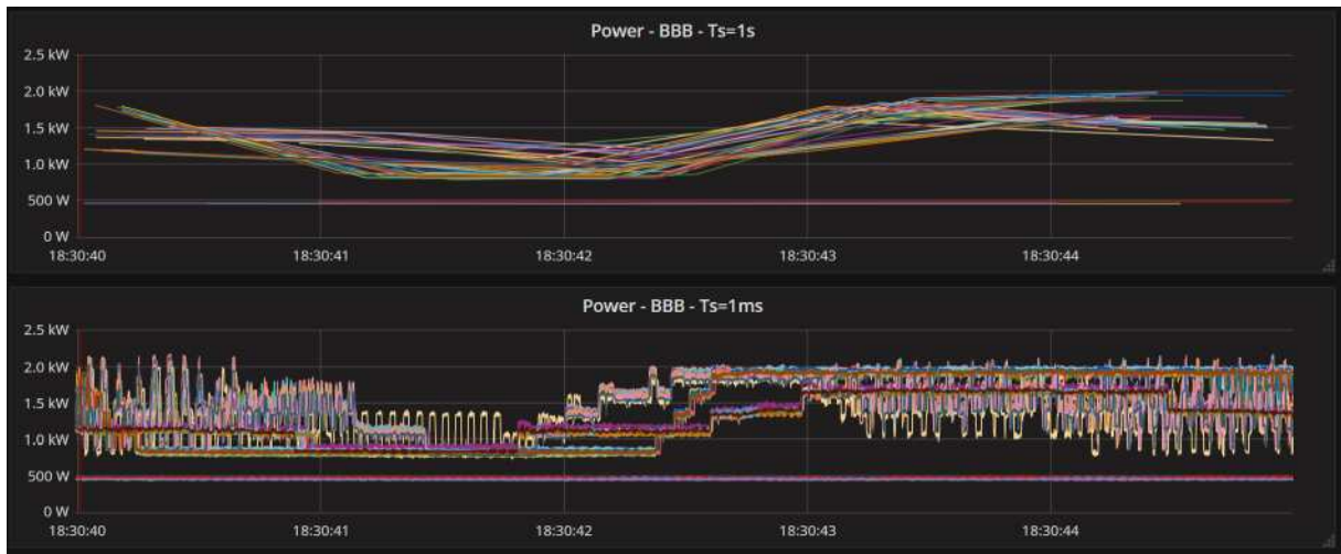
(a) All cluster nodes power monitoring daemon. Zoom of 4 seconds. (Top) Topic at 1 s. (Bottom) Topic at 1 ms.