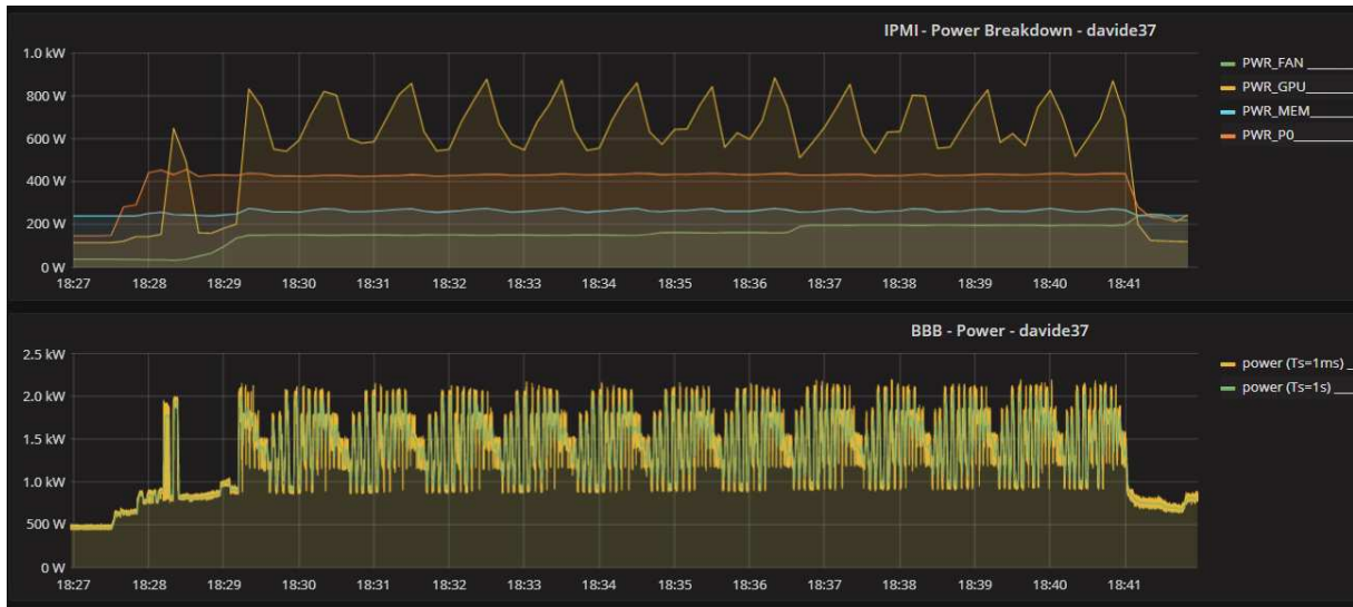
Figure 3: Grafana Snapshot on time windows of 15 minutes (18:27-18:42). OCC and IPMI Daemon per component power measurement (Top Plot) vs. Node Power Consumption Daemon (Bottom Plot).