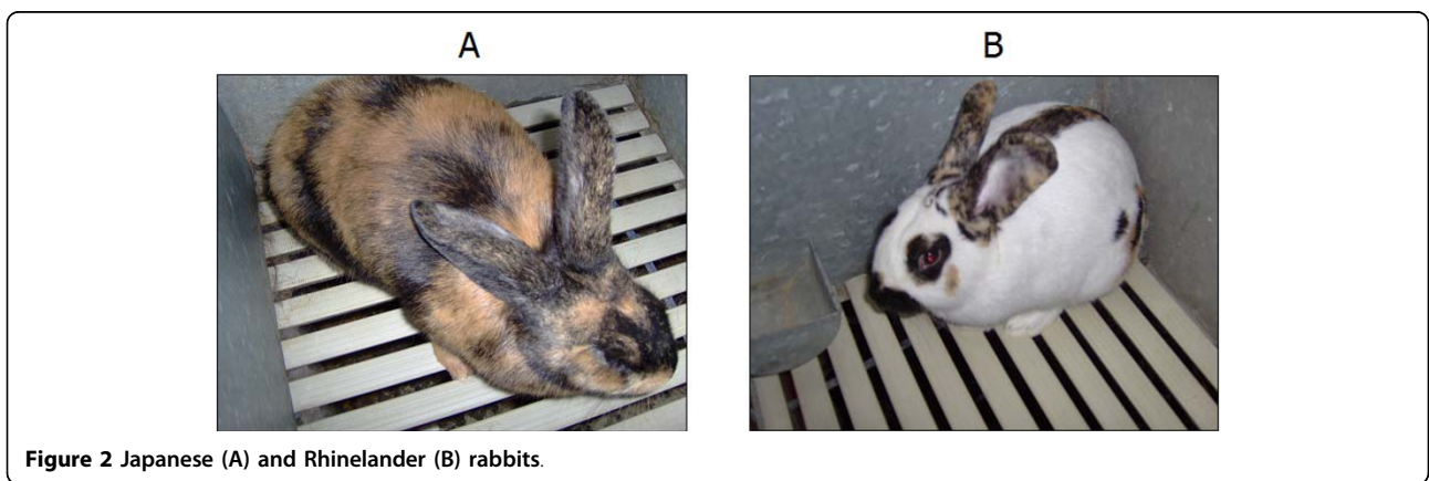
Figure 2 Japanese (A) and Rhinelander (B) rabbits.