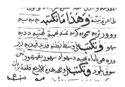
FIGURE 3 MS Paris BnF Par. Ar. 2250, f. 115<sup>r</sup> (detail), strokes above the lines with magical names

us with the possibility to check for the presence of any resemblance between the Greek and Arabic names of the spirits. Even with tentative restorations of the scarce dotting of the Arabic names, they do not seem to show any direct connection to the Greek names.<sup>18</sup> The Arabic text specifies that this is a Syriac talisman, meaning that this copy ( nusha ) is from the Arabic.<sup>19</sup> The strokes over the magical names are an interesting palaeographic feature related to the technical character of the text. They are meant to mark a clear separation of this peculiar component from the rest of the text: as words that were, like the rest, written in the Arabic alphabet, but that should not be read in the same way (Fig. 3).<sup>20</sup>