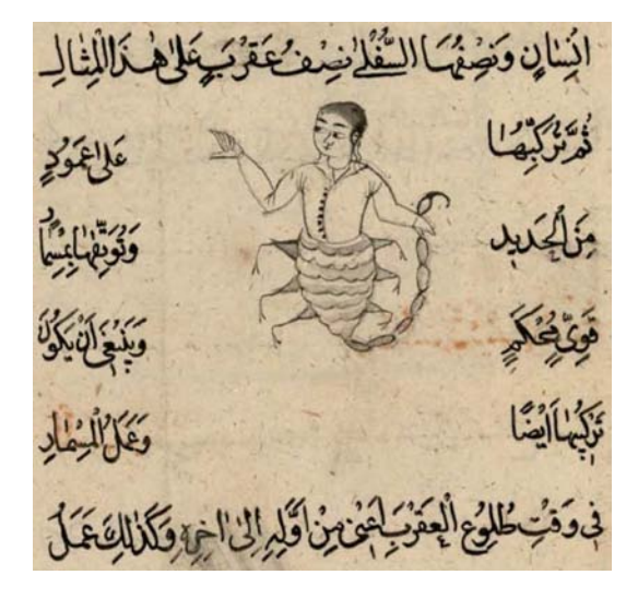
FIGURE 4 мs London вь India Office 673, f. 41<sup>v</sup> (detail), figure to be engraved on Apollonius' talisman against scorpions, as transmitted in The Treasure of Alexander

The figure is half man, while the lower part is a scorpion. This is the image: