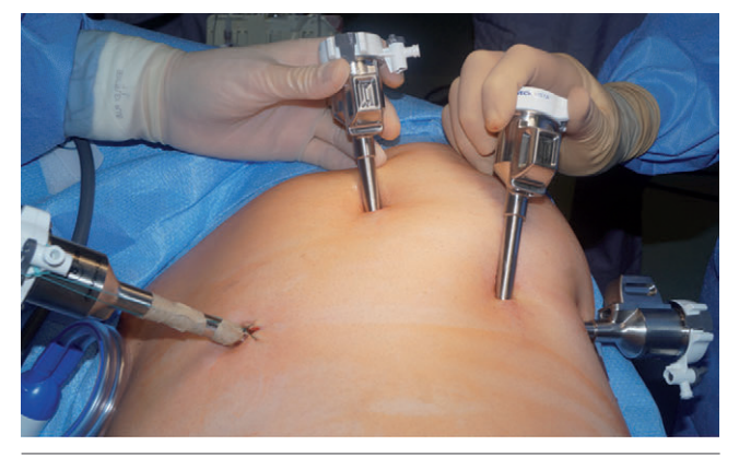
Figure 2. Four 8 mm-ports were advanced into the thorax after a right lateral decubitus was achieved.

BH represents a rare entity in the adult population. Its actual incidence, the relationship between its presence and symptoms and therefore indications for surgery are not clear even though the majority of authors, being aware of the possible severe complications, recommend surgical correction in all cases. The use of thoracoscopy is a safe surgical approach in an elective environment with low morbidity and shorter hospital stay and therefore surgeons familiar with these techniques should consider a minimally invasive approach when treating patients with BH. Furthermore the use of robot-assistance to thoracoscopy could facilitate surgeons in the future to achieve correction.