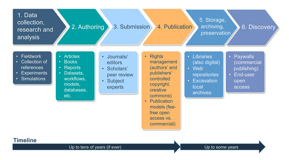
Fig. 1 Current research and dissemination cycle

to modern databases—for example, the Human Relations Area Files or the research of Gardin (1956, 1958, 1976, 1978; see also Dallas 2016). These experiments certainly had an impact on systems of data organization, leading to the creation of digital databases, but they did not change data dissemination practices in archaeology.