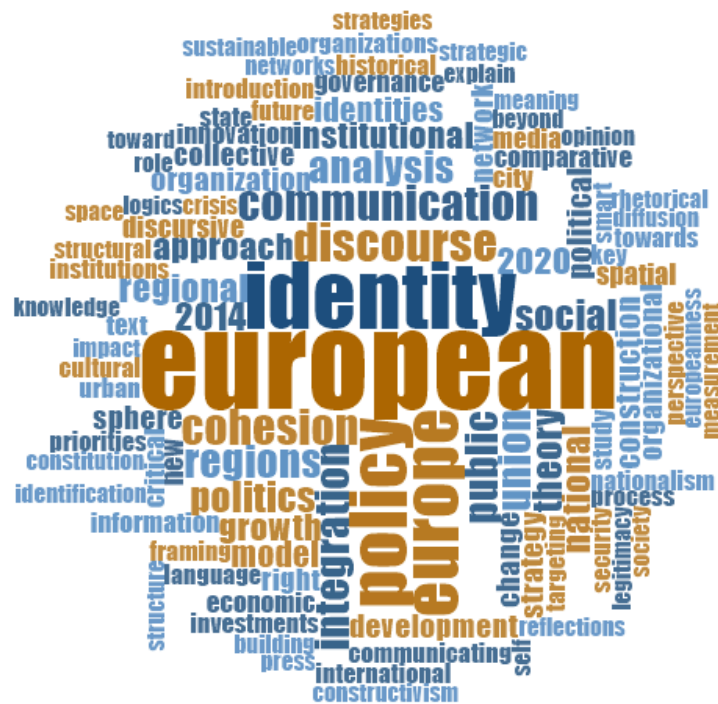
Figure 1 – Word cloud created from social construction literature on European integration

Following previous overviews of academic literature on European integration from social constructivist (i.e. Christiansen, Jorgensen, and Wiener, 1999; Risse, 2009) and discourse (Waever, 2009) perspectives, we distinguish three main areas of application for scholarly inquiry. These three areas focus on a) laws, rules, and norms in EU governance; b) polity and governance ideas, public debate on the EU and its policy; and finally c) social identity and citizens' identification with the EU. Risse motivates the use of this partition as follows (2009: 151): First and with reference to normative systems, “the mutual constitutiveness of agency and structure allows for a deeper understanding of Europeanization including its impact on statehood in Europe”. Second and referring to public debates, the focus on communicative practices allows investigation of “how Europe and the EU are constructed discursively” and how a European public sphere emerges. Finally and with reference to identity, “the constitutive effect[s] of European law, rules, and policies enables us to study how European integration shapes social identities and interests of actors”. For each of these three areas of scholarly contribution, we will highlight the academic background (i.e. International Relations, Comparative Politics, Organization Theory, Sociology, etc.) as well as core insights and contributions to explain European integration and identity.