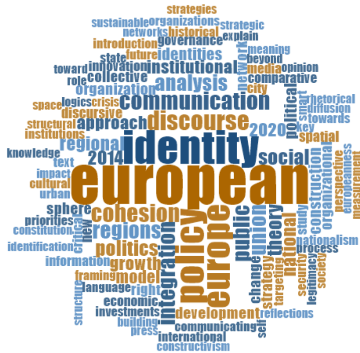
Figure 1 – Word cloud created from social construction literature on European integration

Following previous overviews of academic literature on European integration from social constructivist (i.e. Christiansen, Jorgensen, and Wiener, 1999; Risse, 2009) and discourse (Wæver, 2009) perspectives, we distinguish three main areas of application for scholarly inquiry. These three areas focus on a) laws, rules, and norms in EU governance; b) polity and governance ideas, public debate on the EU and its policy; and finally c) social identity and citizens' identification with the EU. Risse motivates the use of this partition as follows (2009: 151): First and with reference to normative systems, “the mutual constitutiveness of agency and structure allows for a deeper understanding of Europeanization including its impact on statehood in Europe”. Second and referring to public debates, the focus on communicative practices allows investigation of “how Europe and the EU are constructed discursively” and how a European public sphere emerges. Finally and with reference to identity, “the constitutive effect[s] of European law, rules, and policies enables us to study how European integration shapes social identities and interests of actors”. For each of these three areas of scholarly contribution, we will highlight the academic background (i.e. International Relations, Comparative Politics, Organization Theory, Sociology, etc.) as well as core insights and contributions to explain European integration and identity.