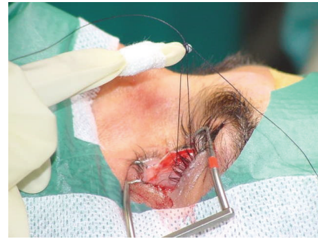
FIGURE 3: The probe is covered by a sterile surgical glove and tied up to the tendon of the lateral rectus muscle with a 5-0 silk suture during strabismus surgery under topical anesthesia.

Eye muscle proprioception has been found in animal models to be implicated in modulating binocular functions during the critical period of development of the visual sensory system. In human infantile strabismus it has been demonstrated that the EOMs of strabismic patients have normal motor nerve endings but ultrastructural alterations on the