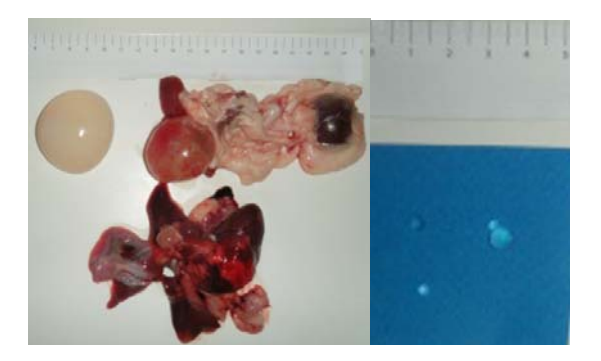
Fig. 1: Cysts of different size found during necropsy.