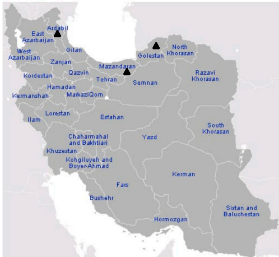
Figure 1. Map of Iran with provinces where Fusarium culmorum isolates were collected (▲).