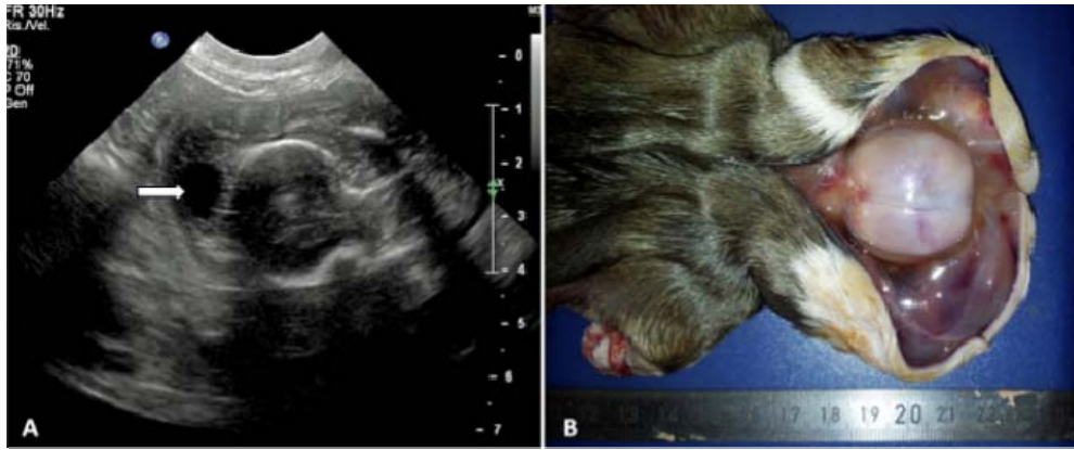
Fig. 1: Comparison between ultrasonographic (A) and necropsic (B) appearance of subcutaneous oedema of the head in the most severely affected puppy. Subcutaneous oedema is marked with the white arrow in the ultrasound capture.