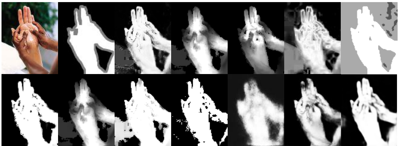
Figure 2. Schmugge367.jpg: (from left top to right bottom) input, ground truth, GMM, Bayes, SPL, Cheddad, Chen, SA1, SA2, SA3, DYC, SegNet, U-Net, DeepLab.