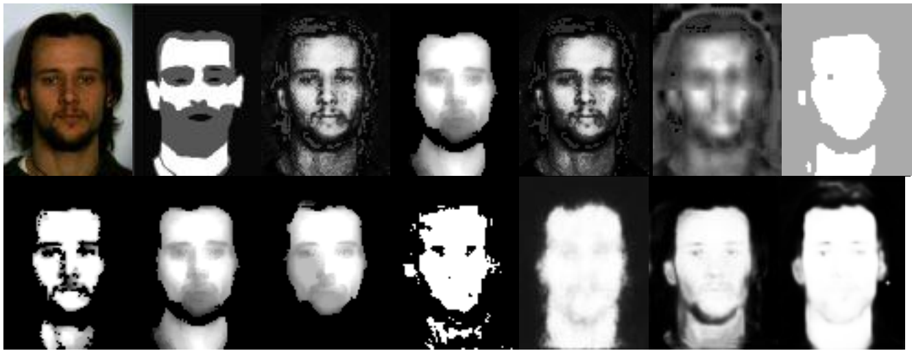
Figure 1. Schmugge005.jpg: (from left top to right bottom) input, ground truth, GMM, Bayes, SPL, Cheddad, Chen, SA1, SA2, SA3, DYC, SegNet, U-Net, DeepLab.