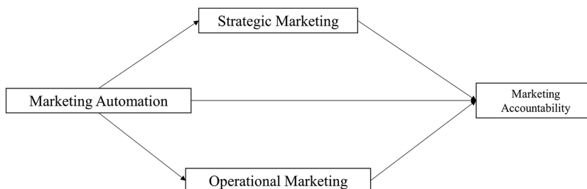
Figure 1. The identified components of marketing accountability