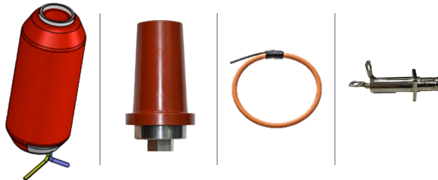
Fig. 1. Pictures of LPITs.

To summarize, the main LPVTs and LPCTs technologies plus the typical influence quantities are collected in Figure 2.