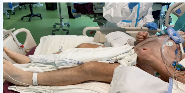
Video 1. The reported patient 10 days after admission showing multiple cranial nerves involvement (right abducent, left oculomotor and left facial cranial nerves palsies), peri-oral myoclonia, sub-continuous right pectoralis muscle myokymia, hyperekplexia (with massive tactile stimulus-induced startle response despite deep sedation) and diffuse hyperreflexia, despite ongoing therapy with midazolam, propofol, fentanyl (all of them continuously), clonazepam (2.5 mg tid) and levetiracetam (1000 mg tid). Video content can be viewed at https://onlinelibrary.wiley.com/doi/10.1002/mdc3.13712

Regarding SARS-CoV-2 infection, previous reports have associated it with neurological disorders through various pathogenetic