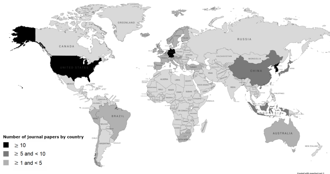
Figure 2. Geographical distribution of journal papers.

For this analysis we considered only those papers belonging to the topic-categories Mathematics education in a country and Comparative studies at a national level , presented in detail in the next section. The considered sub-sample comprises 74 journal articles and 123 conference papers. We counted the number of papers explicitly involving one or more countries and drafted the maps below (figs. 2 and 3).