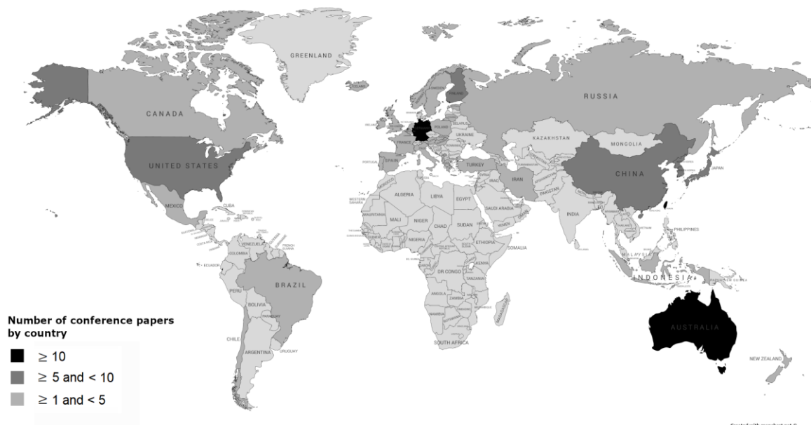
Figure 3. Geographical distribution of conference papers.

We can observe that the most mentioned country is Germany (17 journal papers and 13 conference papers). However, we can also find a high number of papers about eastern countries like Korea (journals: 15, conferences: 9), Taiwan (journals: 2, conferences: 13), China (journals: 6, conferences: 5), and Japan (journals: 5, conferences: 5). Usually, they are compared with western countries in Europe or North America; indeed, among the papers classified as Comparative studies at a national level , 26 (journals: 14, conferences: 12) compare at least an eastern country to one or more western countries. As Owens (2013) already noticed in the field of general education, also in mathematics education there is an imbalance in the study of PISA results around the world. Europe, North America and Australia are the areas to which most of the research on PISA refers. Asia and South America are mentioned in fewer studies, and Africa is almost not represented at all. It is also true that the African continent had fewer countries (yet still some, like Algeria and Tunisia) which participated in the PISA survey.