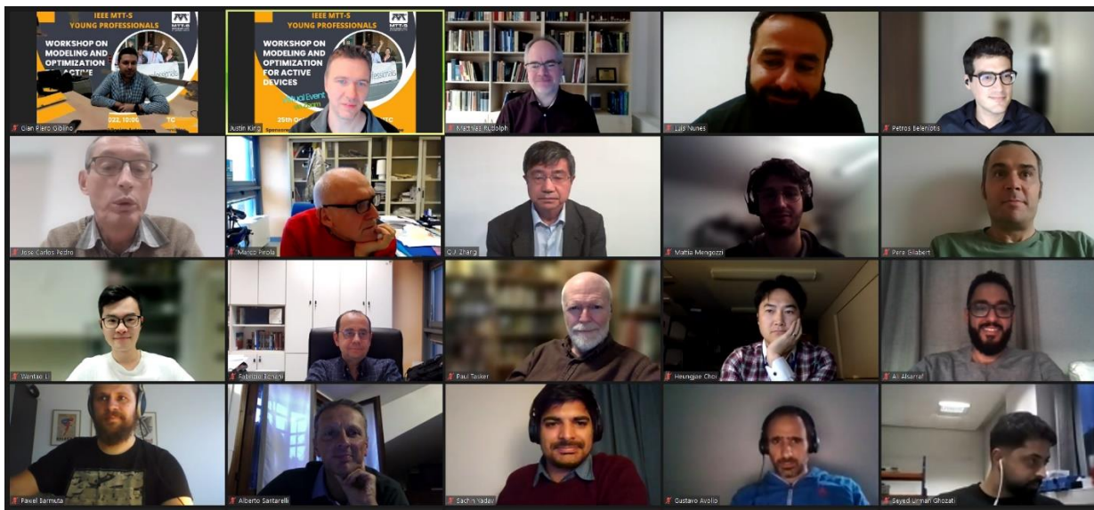
Fig. 2: Attendees of the Workshop on Modeling and Optimization for Active Devices.

In total, there were more than 200 registrants with a peak of approximately 70 simultaneous active participants throughout the course of the workshop. A snapshot of attendees is provided in Fig. 2. Despite the different time zones, a Zoom-based poll showed that the meeting consisted of participants from all over the world including, in decreasing number, Europe, USA/Canada and Asia. Most attendees responding to the poll were at the Master's/PhD stage of their careers (48%), followed by University Professor (28%), Professionals in Industry (17%) and finally Research Assistant (7%).