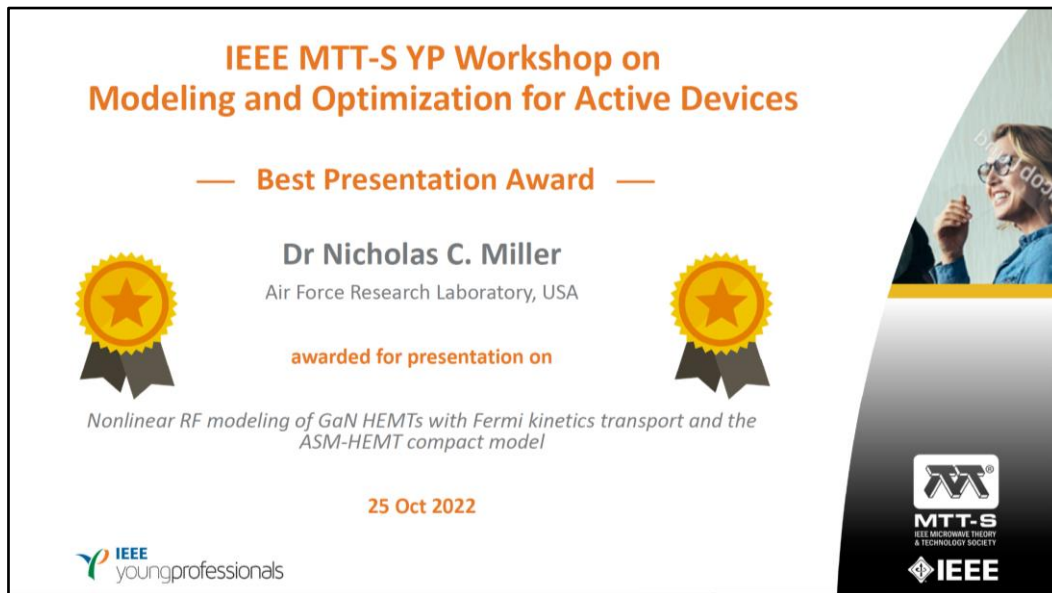
Fig. 3: Best Presentation Award.

Overall, an average of approximately 23 valid votes were received for each presentation. The winning presentation was by Dr N. Miller, entitled 'Nonlinear RF modelling of GaN HEMTs with Fermi kinetics transport and the ASM-HEMT compact model', as shown in Fig. 3.