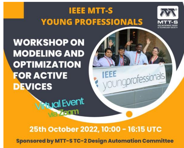
Fig. 1: Workshop Advertisement Banner.

The first IEEE Young Professional Workshop on Modeling and Optimization for Active Devices took place on October 25, 2022, as a virtual event on Zoom. This workshop, supported by the Technical Committee 2 (TC-2) on Design Automation, was endorsed by the IEEE MTT-S and the IEEE Young Professionals (YP). Trinity College Dublin, Ireland and the University of Bologna, Italy provided organizational support.