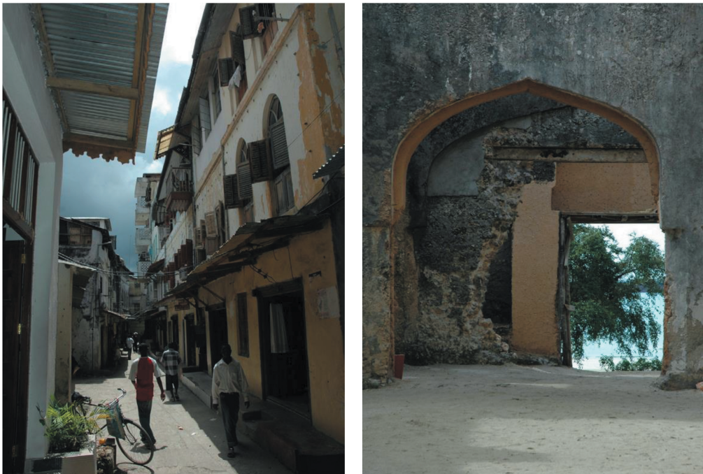
Figure 1. On the left, the streets of Stone Town of Zanzibar. On the right, portion of the city old buildings with the sea on the background. (Author: Ron Van Oers, https://whc.unesco.org/en/list/173/gallery/&index=1&maxrows=12 ).

Stone Town (Figure 1) is located on an island archipelago making it more vulnerable from the threats of climate change like floodings, droughts and cyclones (Myers, 2020). Recently it has been reported on the island of Zanzibar the increase of temperatures, rainfall variability, higher wind speeds and excessive high tide levels (Myers, 2020). This situation has led to considerable socioeconomic impacts on Zanzibar’s development and the impacts with the passage of the time are expected to be higher.