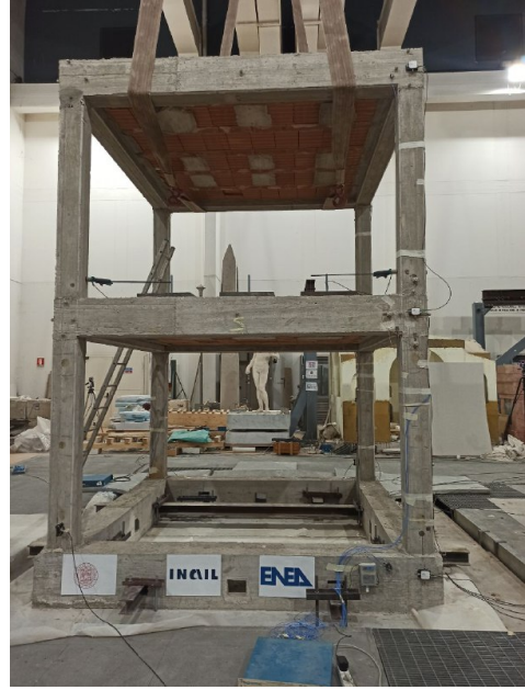
Fig. 1: MAC4PRO monitored concrete structure.

Zion is consumed by other MODRON components, which list and visualize the indexed WTs. Through the graphical user interface, users control which set of TDs and features they wish to visualize. This user input is translated into Zion queries. Figure 1 depicts one scenario of the MAC4PRO project in which MODRON enables the monitoring of the concrete structure. The image showcases a test of a shaking table applying seismic inputs to a concrete structure.