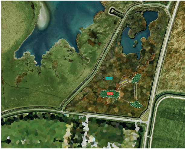
Figure. Landscape mosaic and its components identified on a fragment of Mishka Henner's 'Willem Lodewijk van Nassau Kazerne, Vierhuizen, Groningen' (diagram by the author).