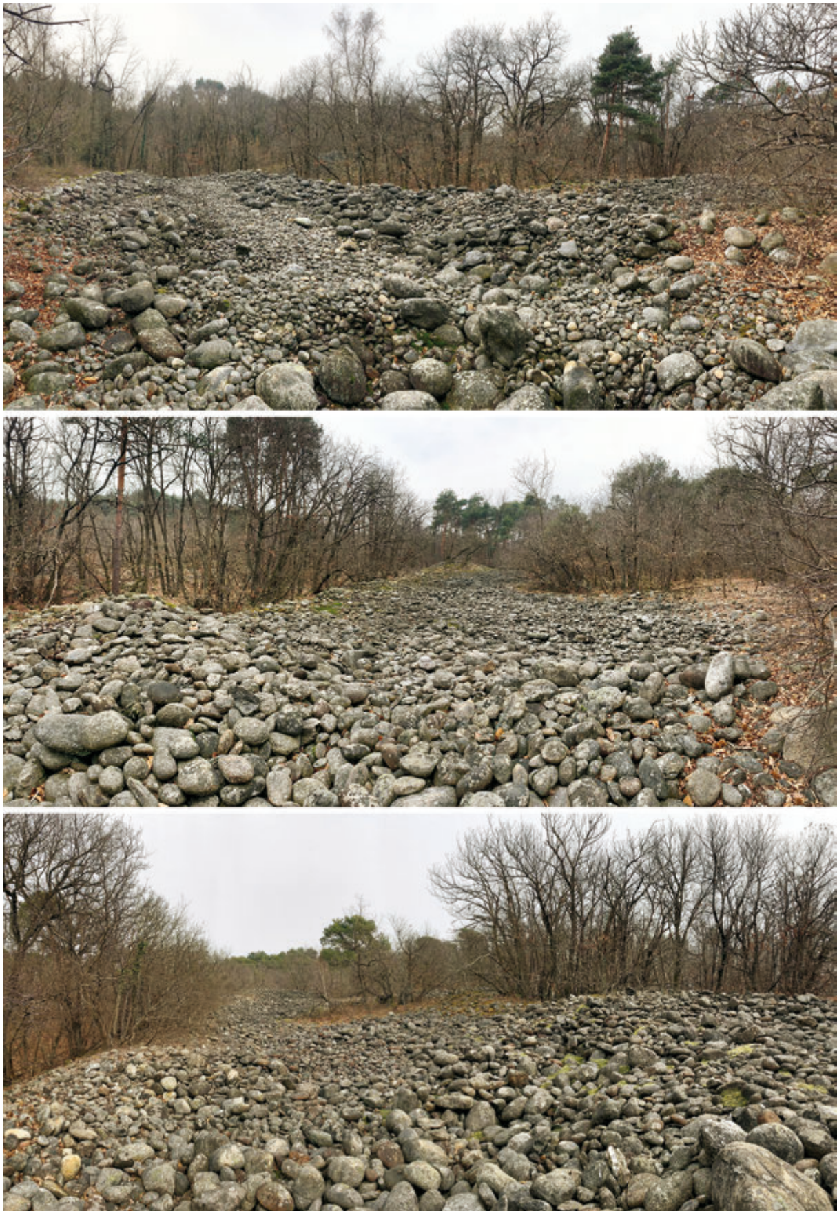
Fig. 2 - Wide-angle views of some stone heaps in “Campo dei Fiori”. / Visuali grandangolari di alcuni dei cumuli di pietre in località “Campo dei Fiori”.